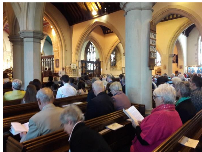
Sunday Morning at St Oswald's

Give, and it will be given to you. A good measure, pressed down, shaken together and running over, will be poured into your lap. For with the measure you use, it will be measured to you. Luke 6:38