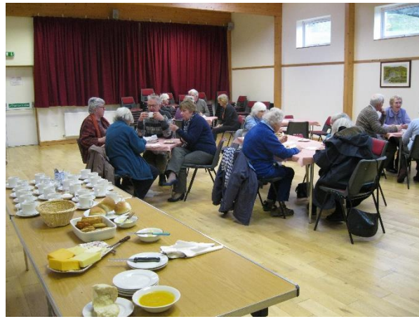
Lent Lunch in the Village Hall, March 2017

Church stall at the annual Village Show and Autumn Fair